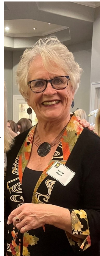
Renowned artist Karyn Plater

Founded in Japan by Iwao Saito , Kuranai Kai produced exquisite embroideries and realized he wanted to spread the techniques and the spirit of silk embroidery with the help of Shuji Tamura to the public and even beyond Japan. Japanese embroidery, known as Nihon Shishu , uses silk and metal thread on silk fabric. The subject matter comes from nature: flowers and plants, birds and insects, along with forces of nature such as wind and water. The silk thread is composed of 12 single strands of silk, each from a separate cocoon.