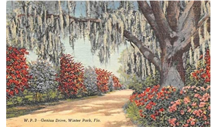
Genius Drive Postcard

This last outing of the season by the Hiking Group was to the Genius Preserve in Winter Park where three lakes meet; lakes Virginia, Mizell and Berry. Genius Drive is usually closed to the public, but through a member and a friend (and of course the help of the fairy), the closed doors of the Preserve were opened for our group to enjoy nature, feed the peacocks on the property, and cherish each other's friendship and company.