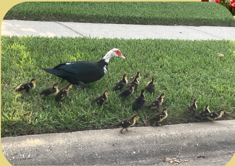
April Blooms in Longwood Gardens PA