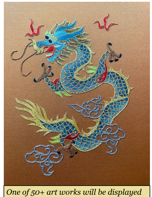
One of 50+ art works will be displayed