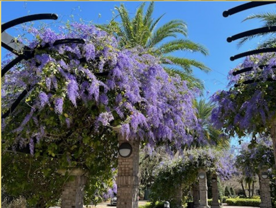
Winter Blooms in Winter Springs Florida