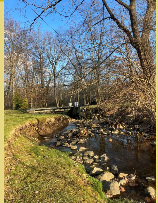
Winter Solitude in Eastern PA