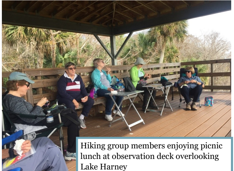
Hiking group members enjoying picnic lunch at observation deck overlooking Lake Harney

During Feb, the group hiked the St. Francis Trail in Deland. This hike of 7.8 miles broke the group's previous record for longest walking distance. (The previous record stands at 7.1 miles on the Black Bear Trail.) The wide and easy-to-walk trail, fantastic weather, the beauty of St. John's River and St. Francis Dead River, the ghost town of St. Francis, bizarre shapes of the bubbles forming near the spring, and a group of lovely trail maintenance crew we met on our way, all added to the enjoyment of the place that once was a thriving town of St. Francis. Yet in a mere 100 years, St. Francis town became a complete wilderness. Many members took lovely photos of the trail