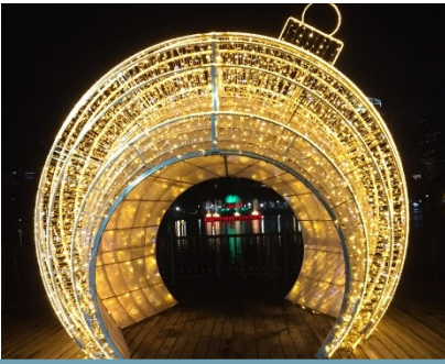
One of many decorations lit during holidays at Lake Eola

Enjoy pictures of our members enjoying the Lake Eola Event and Mead Botanical Garden events!