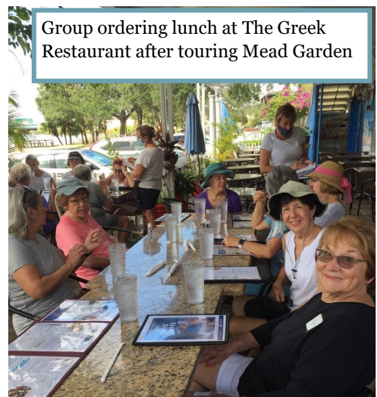
Group ordering lunch at The Greek Restaurant after touring Mead Garden