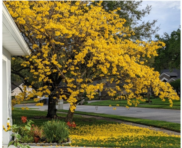
Winter in Florida