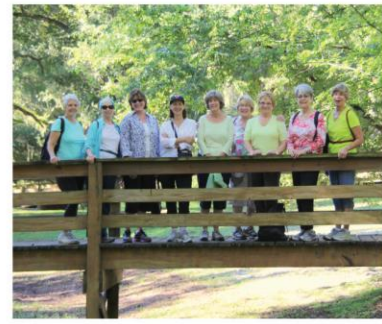
Kelly Park - Hiking Club