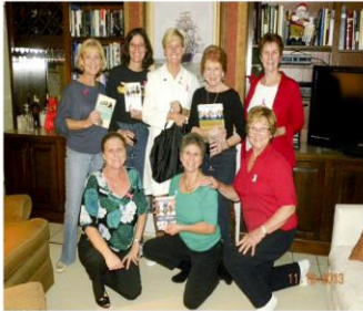
Bookworms Interest Group