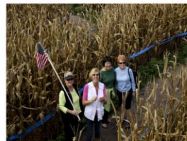
Scotts Corn Maze - Hiking Club