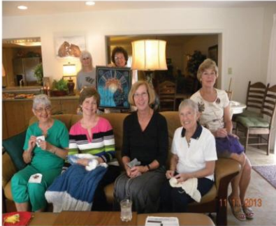
Needlework Interest Group