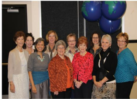
International Friendship Group