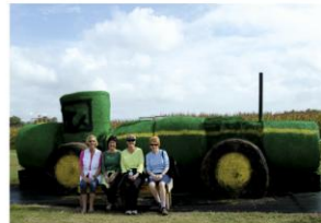
Scotts Corn Maze Hiking Club